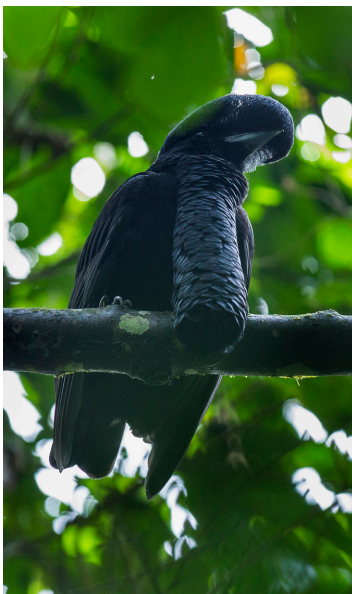
Long-wattled Umbrellabird

Note: The itinerary and accommodation described in these notes are provided as suggestions. Your Private Journey may be modified to reflect your interests, budget and time available. The approximate price is a guideline only.