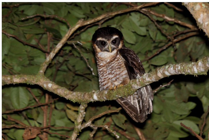
Band-bellied Owl