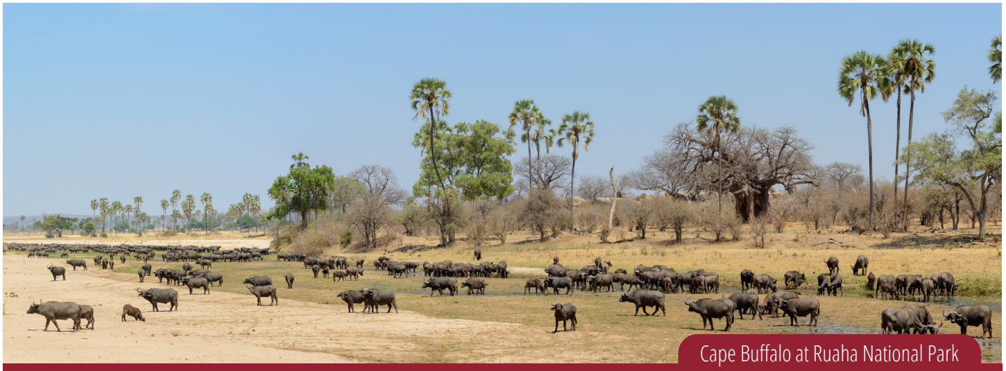
Cape Buffalo at Ruaha National Park