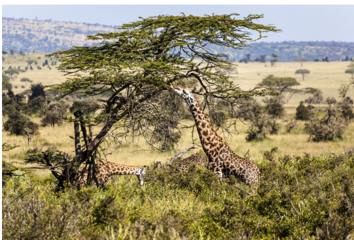
Giraffes at Katavi National Park