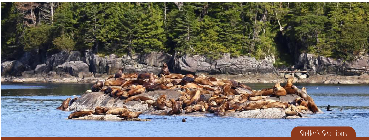
Steller's Sea Lions