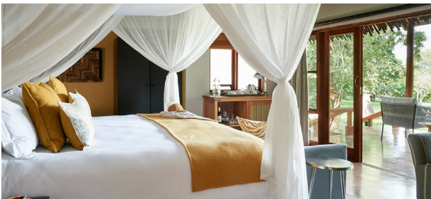
Chobe Chilwero Lodge

Accommodation on this Private Journey is based on standard hotels and lodges, including camps. All rooms have private facilities. A range of accommodation is available including luxury lodges and tented camps. The cost of your Private Journey will vary with the selected accommodation.