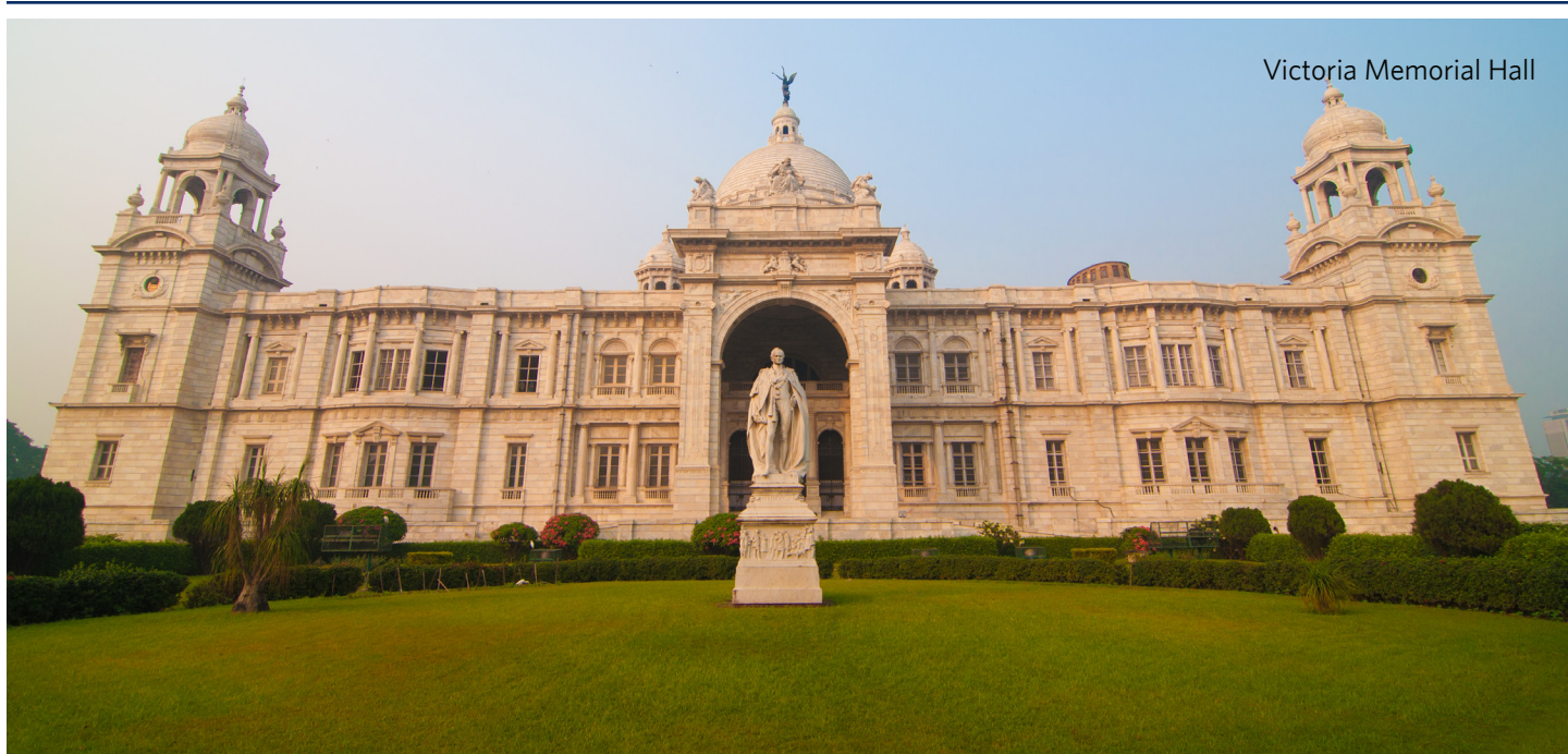
Victoria Memorial Hall

Note: The itinerary and accommodation described in this tour brochure are subject to change due to logistical arrangements and to take advantage of local events.