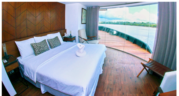
Suites - Lower Deck