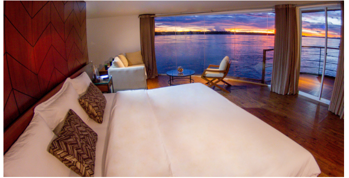
Suites with Balcony - Deck 2